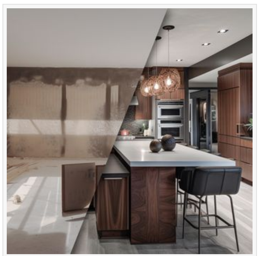
Pacific Proworks Inc. specializes in ADUs, new home builds, and full-service remodeling projects across Los Angeles.

This press release can be viewed online at: https://www.einpresswire.com/article/823775853