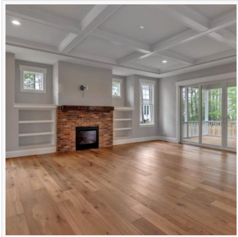
Pacific Proworks Inc. converts garages into legal ADUs that generate rental income across Los Angeles.

• Service areas include Sherman Oaks, Studio City, North Hollywood, Encino, and surrounding areas