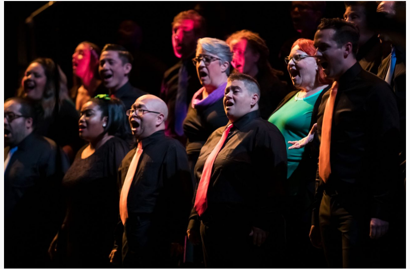
The South Coast Chorale's diverse and unique ensemble encompasses friends, families and supporters.

This performance is supported, in part, by The Port of Long Beach, LA County Department of Arts and Culture as part of Creative Recovery LA, an initiative funded by the American Rescue Plan.