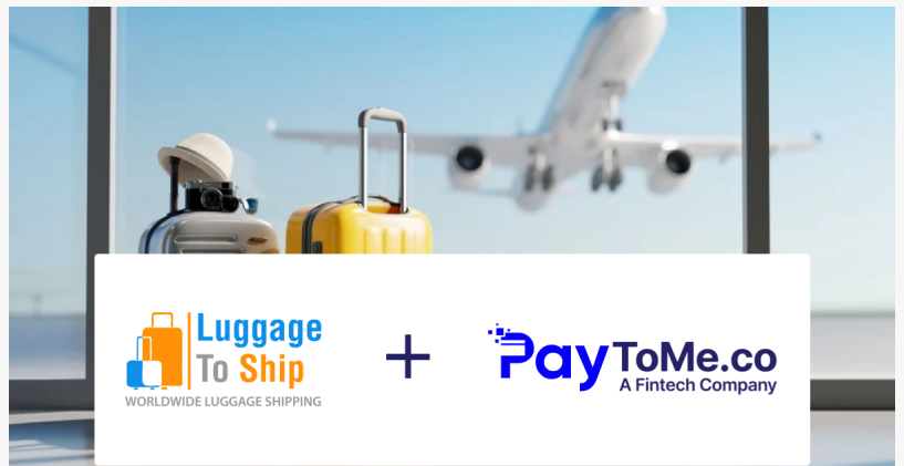
LuggageToShip.com and PayToMe.co= Partners