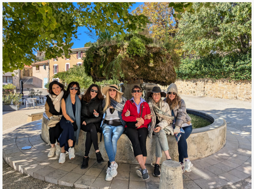
Provence Adventure to Vaucluse in the Southern Luberon area

Limited spots are available. To reserve your place or learn more, visit https://www.pitcherandpowell.com/adventures/provence/