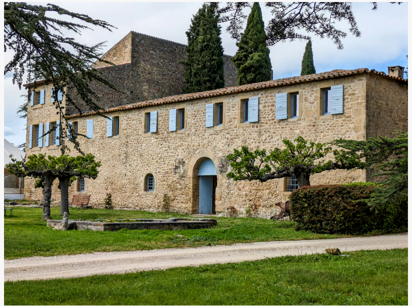
Welcome home to Château St. Pierre de Méjans, a breathtaking gem in Provence.

/EINPresswire.com/ -- This Fall, Pitcher & Powell invites women travelers to slow down and savor the good life with their signature Provence retreat—an immersive culinary and cultural adventure for those seeking a deeper connection to food, wellness, and French tradition. The next adventure is a one-week trip starting on September 26, 2025.