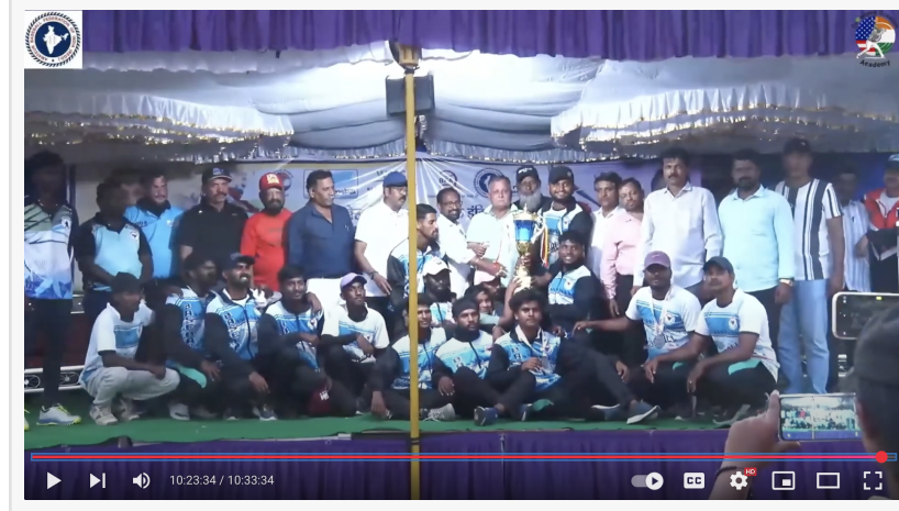
The Andhra Pradesh State Men's Team with official dignitaries at the closing ceremony

"For over a decade, I've dedicated myself to growing baseball in every corner of India—and this broadcast is a landmark moment in that mission. It's not just about streaming a tournament; it's about telling the untold story of Indian talent, passion, and perseverance. With voices coming together from India and the U.S., we're not just playing a game—we're building a movement. This is a bold step toward our vision of making baseball a recognized and celebrated sport in every Indian household."