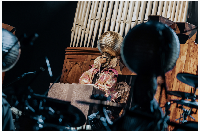
Erykah Badu performs live at The Bomb Factory as part of Amazon Music's Black Music Month Celebration, "Forever in Rotation.