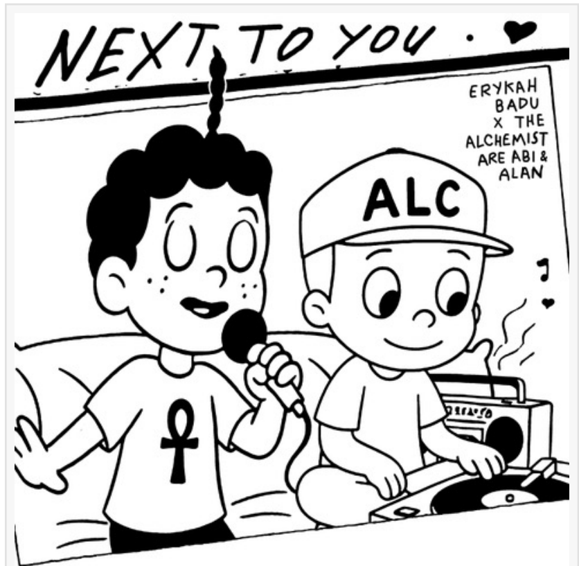
Next To You Single Artwork

DALLAS, DC, UNITED STATES, June 20, 2025 /EINPresswire.com/ -- Multi-Grammy-winning musical icon Erykah Badu has returned with her first lead single of this decade called "Next To You"—self-executive produced and in collaboration with legendary hip-hop producer The Alchemist. The Queen of Neo-Soul wears another hat on this single—one the music world hasn't fully grasped. Not only is she making an offering to The Alchemist's beats with her iconic voice, but she's stepping into the light as a more seasoned producer. From playing synths to arranging horn sections, Erykah is unveiling a deeper layer of her artistry as a skilled b-girl—showing the music world her vision as a sonic architect and evolving apprentice.