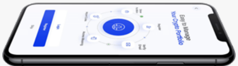
Moonrig intelligence engine