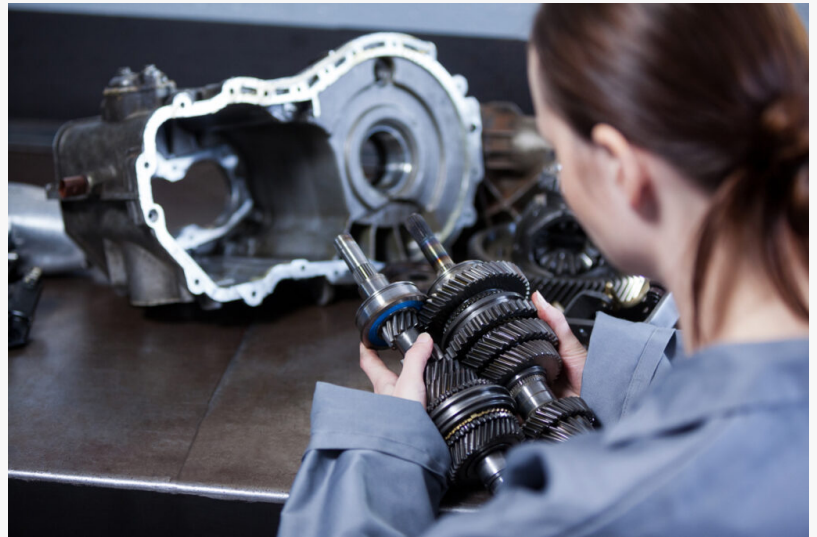
CVT Transmission Services-