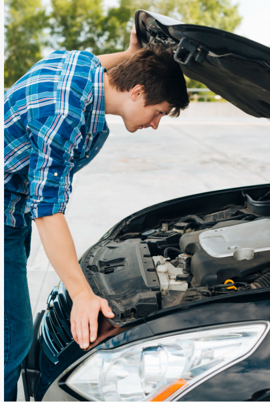
Auto Repair Services-

What truly makes Cruz Automotive stand out is its focus on customer satisfaction. Every team