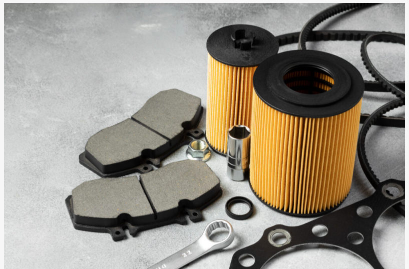
Air Filter Replacement-