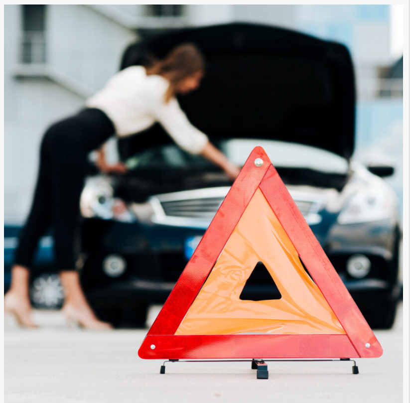
Manual Transmission Repair-