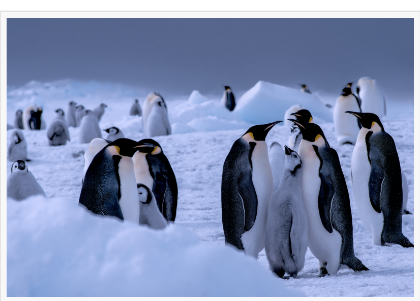
The Bruno by Enderby Entertainment

With only 8.5% of the world's oceans protected and less than 1% of environmental philanthropy focused