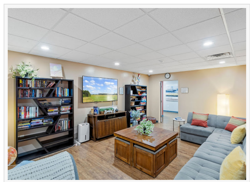
Soba New Jersey Interior

Confusion, disorientation, delirium, and hallucinations