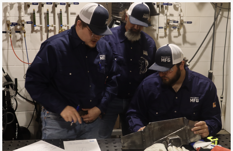
Judges assessing Maritime project