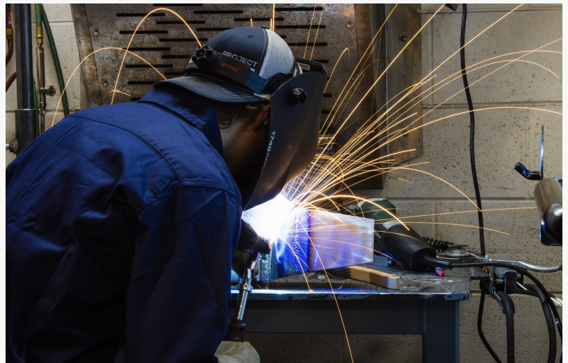
Maritime Competitor working on a project