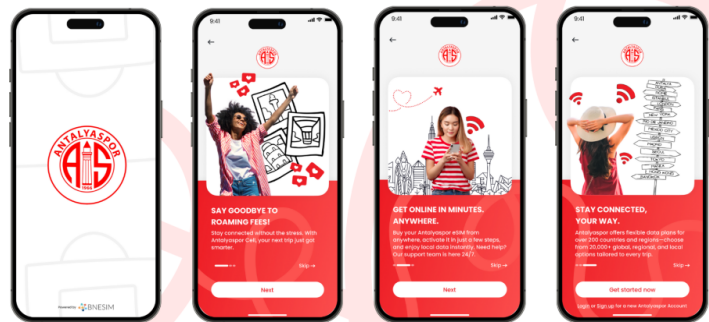
AntalyaCell Powered By BNESIM

Combining BNESIM's award-winning platform with Antalyaspor's passionate community, Antalya Cell delivers an intuitive, club-branded international mobile solution that empowers users to stay connected while supporting their favourite team. The project also extends beyond football: Antalyaspor will work with the city's travel agencies and hotels so visitors can activate low-cost data plans at check-in, ensuring friction-free connectivity throughout their stay on the Turkish Riviera. Whether following a match abroad or simply exploring the globe, users can now enjoy affordable data plans, zero roaming fees and instant activation—directly from the app.