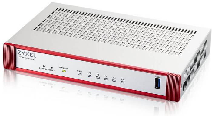
Zyxel Networks USG FLEX H Series Firewall