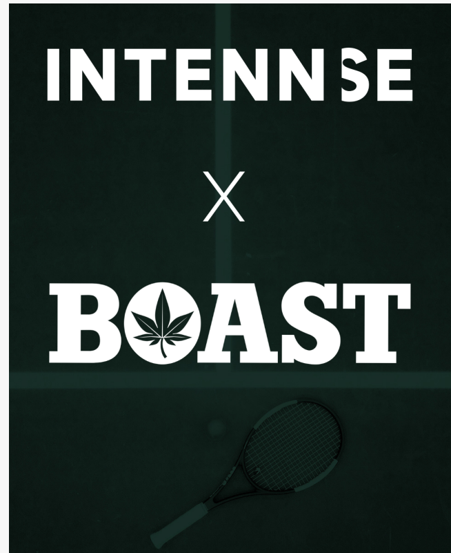
INTENNSE and Boast Partner Up

Founded in 1973, BOAST is the original American tennis brand. From reigning on-court and in country clubs to its rise in pop culture, BOAST has always been a challenger brand and embodies a champion's spirit – taking on the traditional mainstays in tennis and representing those that play on their own terms.