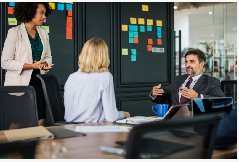
We bring you a full throttle team of dedicated, award winning professionals with years of lead generation and web development experience ata fraction of an in-house marketing team. We are committed to deliver results for you.

fix site friction points and improve customer journey flow