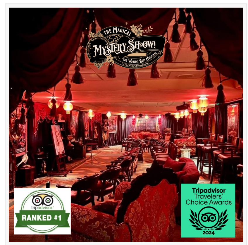
The Magical Mystery Show! at the Hilton Waikiki Beach Resort and Spa, Honolulu, Hawaii

A closer look at popular entertainment options reveals both opportunities and red flags: