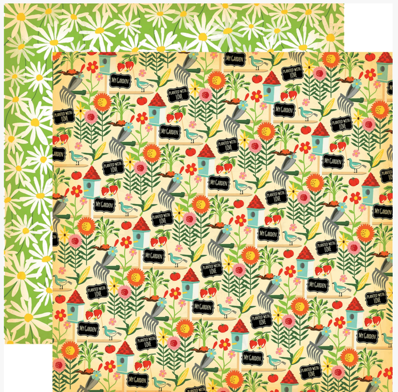
MY GARDEN - 12x12 Double-Sided Patterned Paper

"The shift toward sustainability is no longer optional in the world of paper crafts," said a product development spokesperson from 12x12 Cardstock Shop. "This summer's release brings in recycled fiber-based