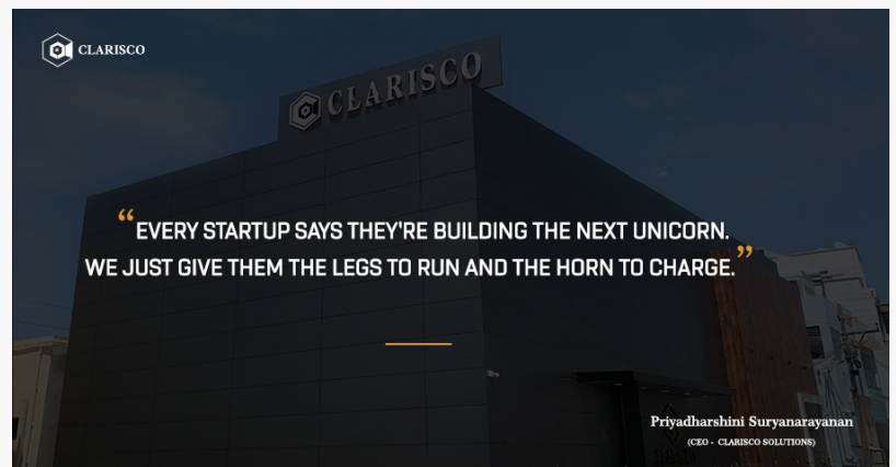
The CEO of Clarisco Solutions about the vision of the company.

MADURAI, TAMIL NADU, INDIA, June 22, 2025 /EINPresswire.com/ -- Clarisco Solutions Pvt Ltd, a global provider of blockchain development and AI-powered solutions, has introduced a new delivery model intended for efficient digital finance infrastructure.