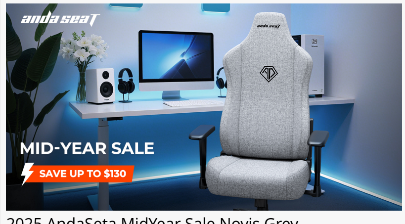
2025 AndaSeta MidYear Sale Novis Grey

compact performance chair, designed from the ground up to meet the needs of users working in shared apartments, mixed-use corners, or mobile studios. The chair features a slim-profile