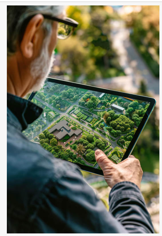
Property Land Survey -

One of the key strengths of RealMapInfo LLC is its familiarity with local zoning regulations, land-use