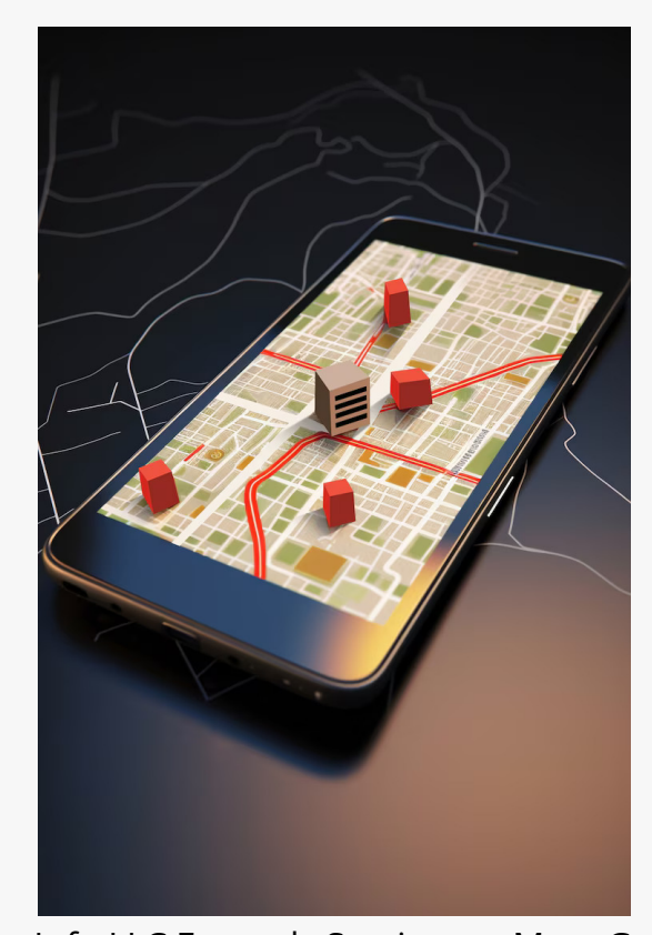
RealMapInfo LLC Expands Services to Meet Growing Demand for Land Survey