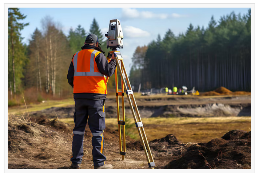
Local Land Surveyors -

As communities across Eastern Massachusetts experience new development and increased property transactions, the demand for accurate land measurements has seen a significant rise. RealMapInfo LLC has responded by expanding its service footprint. With a team led by a licensed land surveyor, the company now actively supports clients in areas such as Worcester, Wayland, Arlington, Belmont, and Holden, among others.