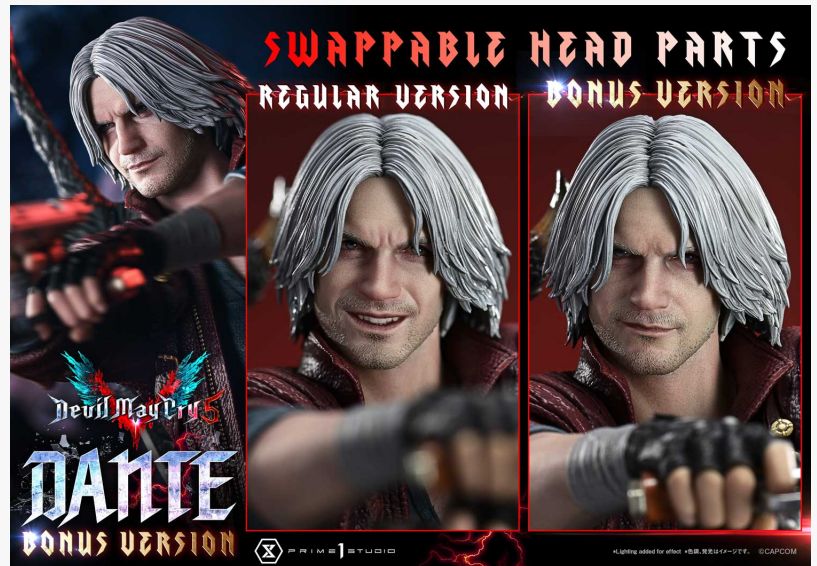
Dante Bonus Part