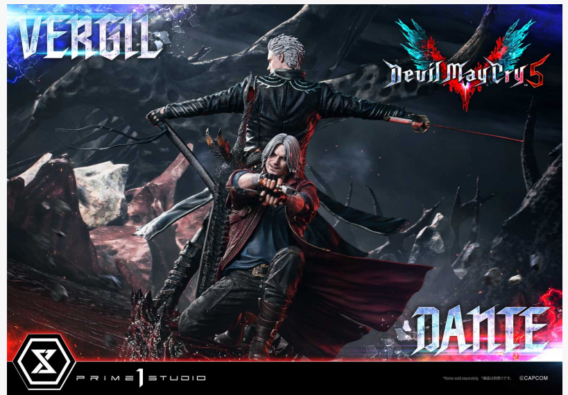
Concept Masterline Devil May Cry V Dante, Vergil

Bonus versions of each statue include an additional swappable portrait featuring a different expression.