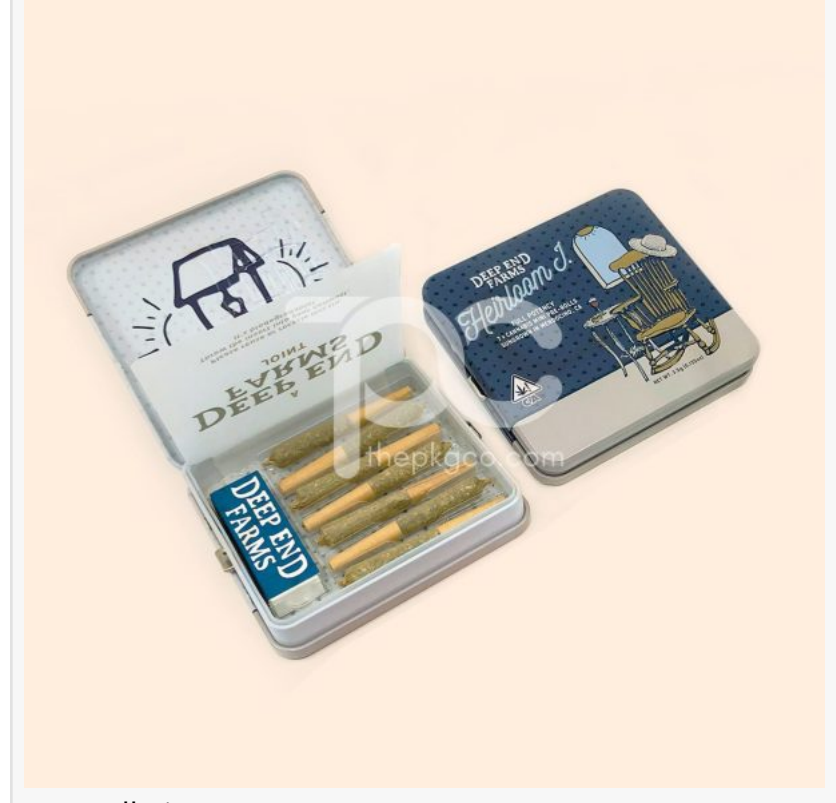
Pre Roll Tin Case --

simplifies compliance checks. The tin's uniform dimensions also facilitate efficient stacking and space utilization in retail and storage settings.