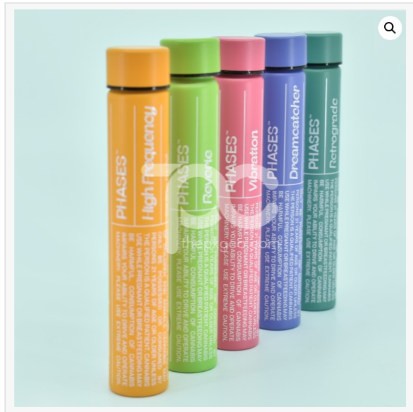
109mm pre-roll tube --

The standardized structure of the 28-pack pre-roll tin allows for streamlined integration into packaging, inventory, and distribution workflows. By consolidating multiple units into a single container, the format supports reduced handling during the packing and sorting stages. For businesses managing a range of SKUs across different regulatory zones, the consistent format minimizes the need for multiple packaging variations and