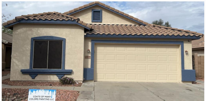
Exterior Painting CMC painting 2