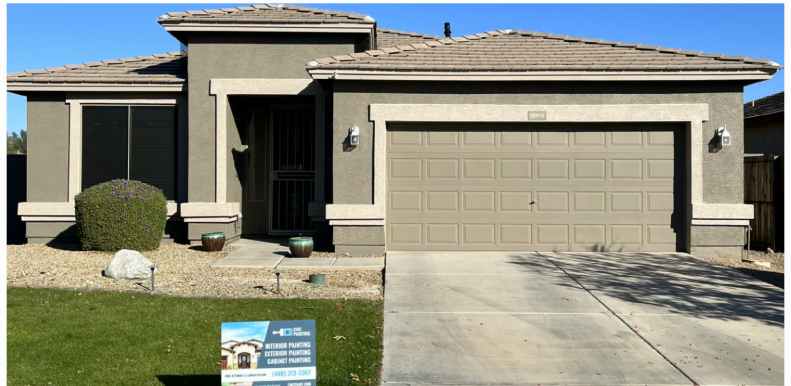
Exterior Painting CMC painting 1