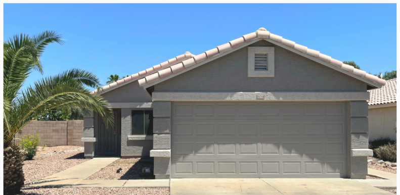
Exterior Painting CMC painting 3