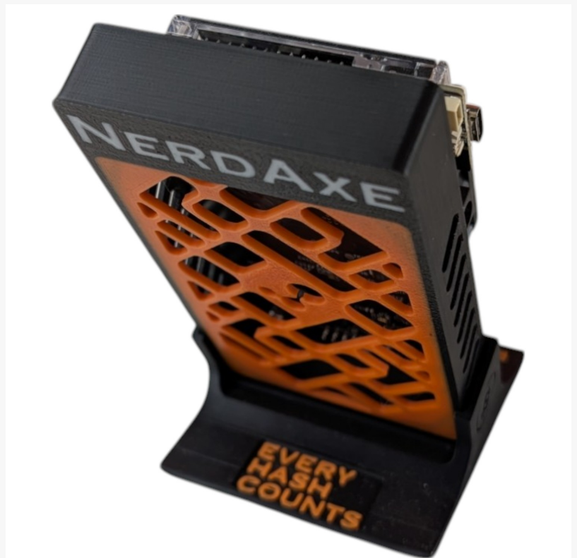
The Nerdaxe Gamma Back in Nerdaxe Modern Stand