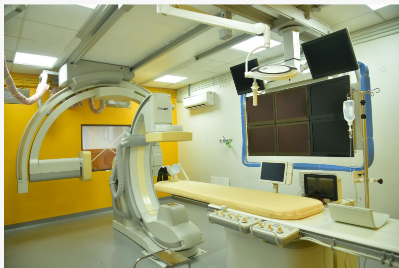
The advanced biplane cath lab at Dr. Rao's Hospital, designed for precision neurovascular procedures and minimally invasive surgeries, first in Andhra Pradesh and Telangana in India.

Neuroendoport Integration: A 13 mm tube helps doctors work from different angles in tight areas (like third ventricular cysts) without causing any damage to blood vessels.