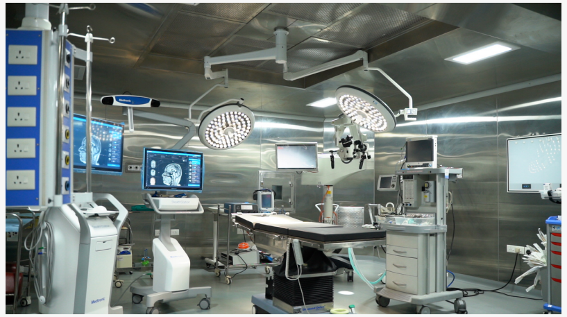
The high-tech neurosurgery operating room at Dr. Rao's Hospital, Guntur featuring advanced imaging and navigation systems for precise brain and spine surgeries.