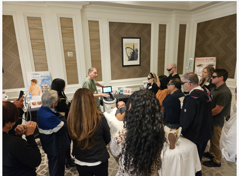
Attendees gathered around patient table observing live procedure

Introduction to Intense Pulsed Light (IPL) (Hair Removal, Facial Telangectasias, Non-Ablative Skin