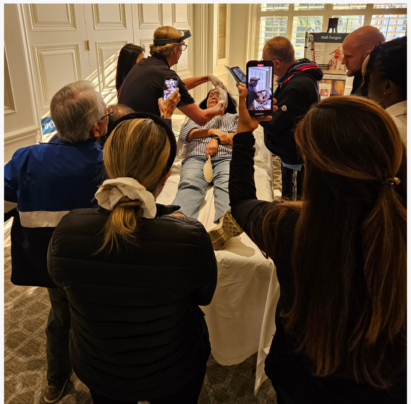
Attendees gathered around patient table observing a live injectable procedure

Attendees are able to bring their own models. Excellent opportunity to see how an aesthetic practice is set up.