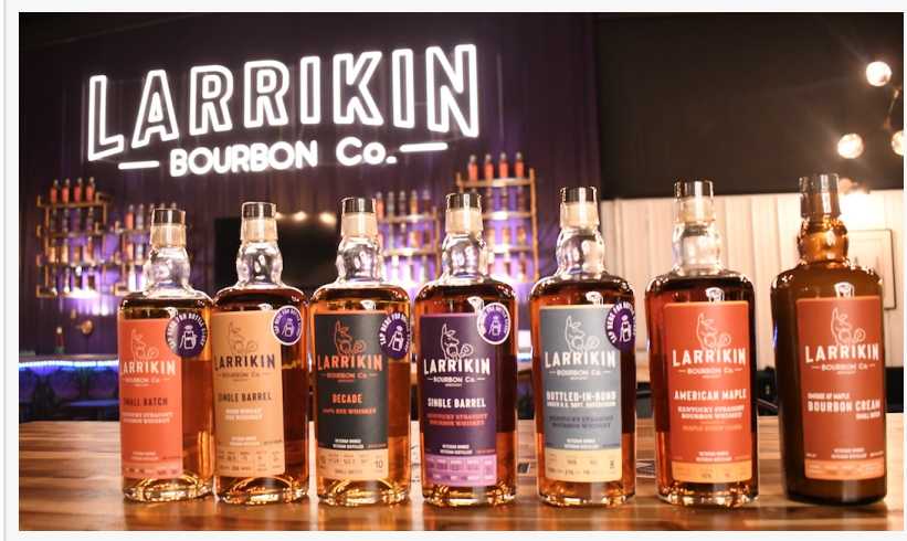
Larrikin Bourbon Co. Award Winning Whiskies

on both sides of the Pacific. We built Larrikin for people who serve, lead, and live with purpose."