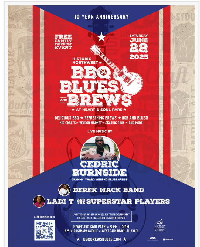
BBQ Blues and Brews Poster

The city has confirmed seven competitors in the BBQ grilling competition; they are: Fosters BBQ; A & A Roadside BBQ and Jerk Center; Meatheads BBQ; Gilberts Riblets, Da King of BBQ, Eat'n Cake, and Twisted Smoke BBQ. They will grill, roast, smoke, and serve classics like juicy pulled pork, tender chicken, smoky ribs, and more to guests AND to the judges, who will award prizes in multiple categories.