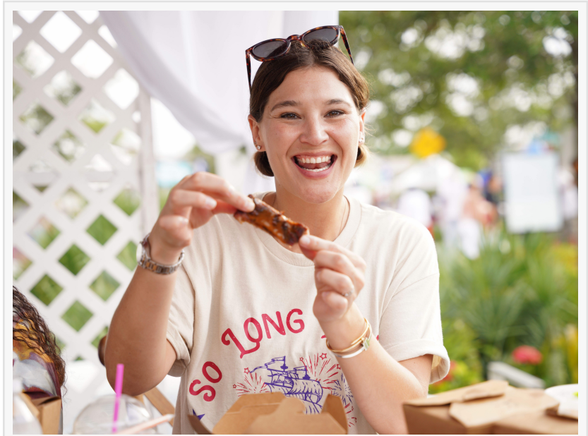
A satisfied BBQ sampler!

Other foods, snacks, drinks and desserts on offer come from Island Smash Bahamian Cuisines, serving fresh Bahamian conch salad and conch fritters; Babci's Kitchen, specializing in Polish, Dominican and American cuisines; Lil' Pearl Peanuts Pickles and More; Food Madness "for bold flavors and classic comfort foods"; City Sweets Italian ices; The Main Squeeze of South Florida juices, smoothies and bowls; Taste T's Pastries, "because pudding is more than a dessert"; Juicylicious, and Master Beef Jerky.