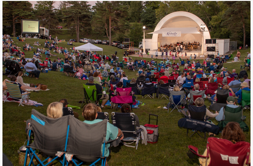
Kids and adults can't sit still at the KSO

NEWPORT, KY, UNITED STATES, June 24, 2025 /EINPresswire.com/ -- The Kentucky Symphony Orchestra opens its 31st Summer Series with a salute to the de facto dean of film score composers. John Williams ' career has spanned nearly 70 years, and his efforts in television and film have emphasized the significance of the film score as a musical genre, comparable to other classical forms — symphony, concerto and opera — of the 18th through 20th centuries. Williams' contributions were important even prior to his noted 50-year association with director Steven Spielberg.