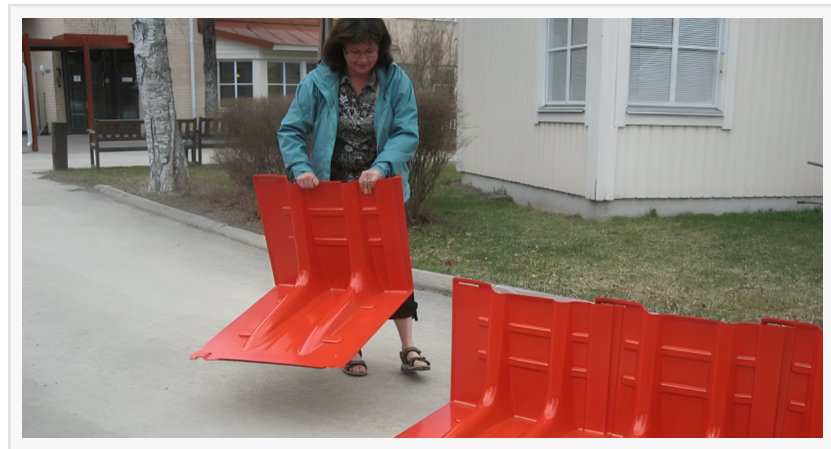
flood barrier systems

Flood Defense Group's approach is centered on adaptability, with a catalogue of flood barriers that includes designs filled with soil, water,