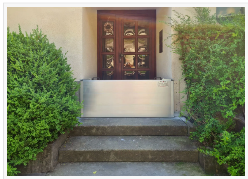
flood prevention systems for homes-

The materials used in the barriers vary by application and include high-density plastics, metal panels, geotextile materials, and other components developed for exposure to water, debris, and temperature changes. Some barriers are reusable, while others are intended for limited use or deployment during specific seasonal events. The adaptability of the systems makes them relevant for a range of users including municipalities, industrial facilities, and residential sites.