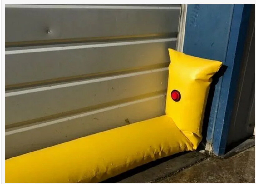
water barriers to prevent flooding

Flood Defense Group also supplies systems designed specifically for building access points. These include options for securing doors, windows, and ground-level openings, which are often vulnerable during sudden flood surges. The systems are designed to form temporary seals that help prevent water ingress in low-lying properties or buildings located in designated flood zones.