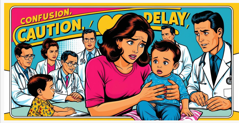
It did not begin with a plan. It began with a mother.

Children who couldn't express themselves were labeled "slow," "stubborn," or worse.