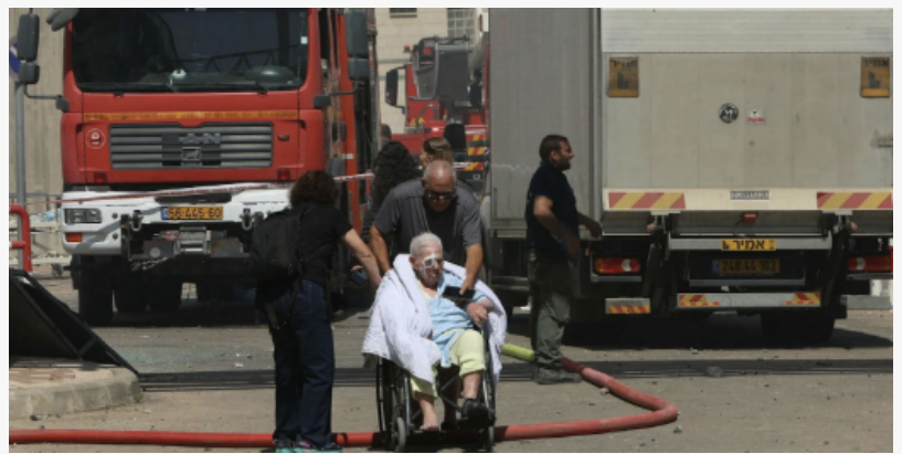
Hundreds of patients have been transferred to medical facilities across the country following the ballistic missile attack.

rendered large parts of the hospital unusable. Clinics and inpatient wards have been shut down. Hundreds of patients have been transferred to facilities across the country or safely discharged to home care. Soroka's Emergency Department and trauma services remain active, operating in fortified zones.