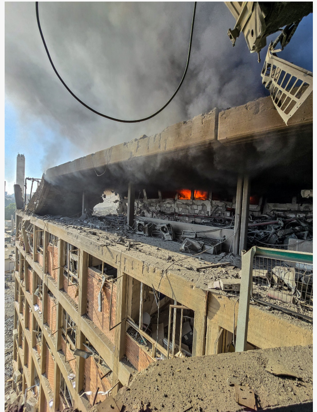
A ballistic missile struck the six-story Surgical Building at Soroka Medical Center.

/EINPresswire.com/ -- In the early hours of June 19, Iran launched a ballistic missile that struck Soroka Medical Center, the only major hospital for southern Israel. It was a direct hit to the heart of Israel's healthcare system. Located in Be'er Sheva, Soroka serves over one million people across the diverse Negev region. Famous as a symbol of peaceful coexistence, Soroka, one of Israel's largest and most respected hospitals, is now operating in crisis mode. Most non-emergency medical services have been suspended. For a region already reeling since October 7, the missile strike brought additional trauma and a dangerous disruption to vital medical care. Though no lives were lost, the damage is profound. The lack of fatalities was thanks to Soroka's visionary leadership, which placed the hospital on high alert and activated emergency protocols refined over years of operating under threat. The timely evacuation of all hospital areas ensured the safety of patients, staff, and clinics in the hours preceding impact.