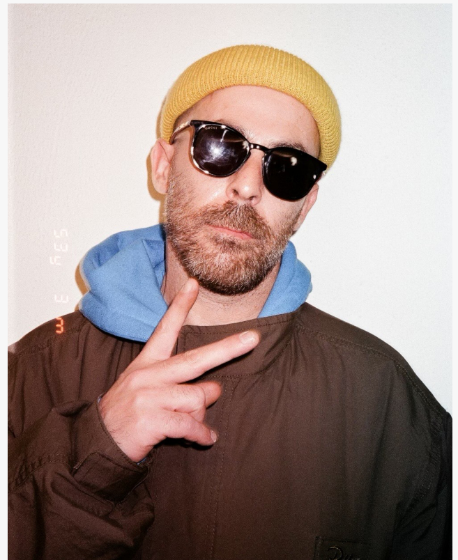
The Alchemist