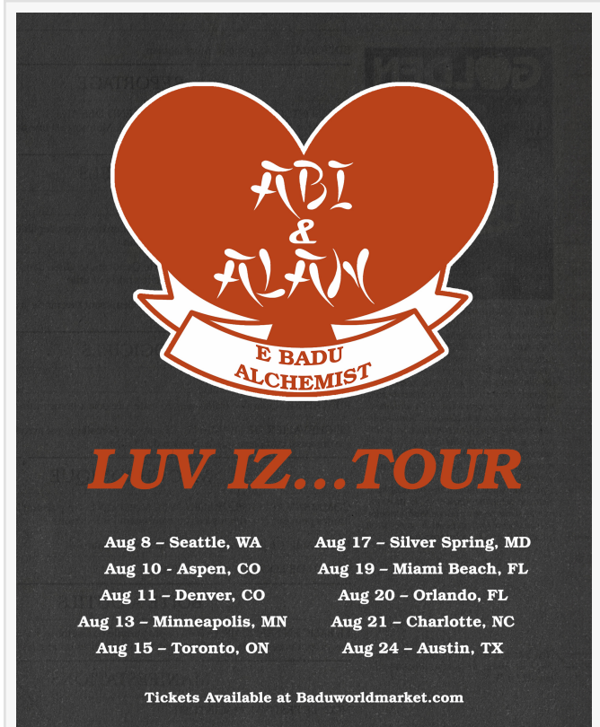
Abi & Alan Tour Dates

DALLAS, TX, UNITED STATES, June 25, 2025 /EINPresswire.com/ -- When five-time Grammy-winning vocalist and powerhouse producer, composer, and independent record label founder Erykah Badu teams up with legendary hip-hop producer The Alchemist , creative genius meets creative genius. The duo is bringing that creative alchemy on the road this August with the " Abi & Alan Tour "—a playful nod to their birth names, Erica Abi Wright and Alan Maman—hitting ten cities across North America. The highly anticipated tour will showcase music from their collaborative album of the same name, with Badu's live digital and instrumental band, The Cannabinoids, bringing the project to life in an intimate, immersive, underground-esque experience.