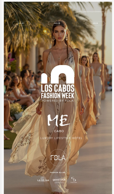
Los Cabos Fashion Week July 23-27, 2025

Fashion Talks: July 24 & 25 – Engage with panels and conversations featuring top voices in fashion, moderated by Lucia Ugarte from Chicas Guapas TV.