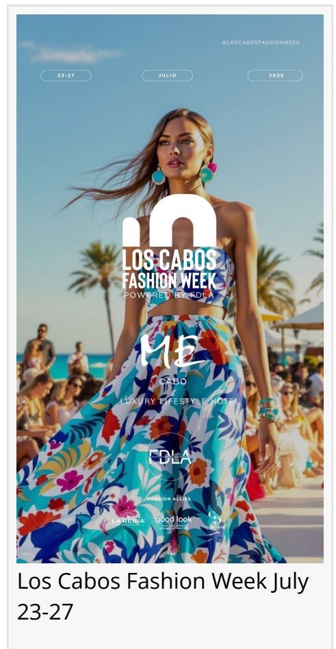
Los Cabos Fashion Week July 23-27

This press release can be viewed online at: https://www.einpresswire.com/article/825400626