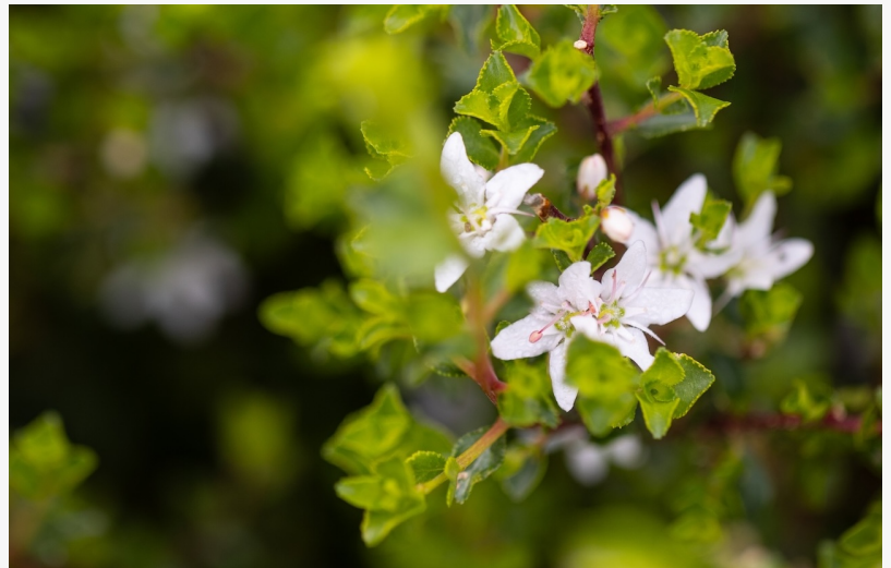
A matured Buchu bush in its flowering stage.