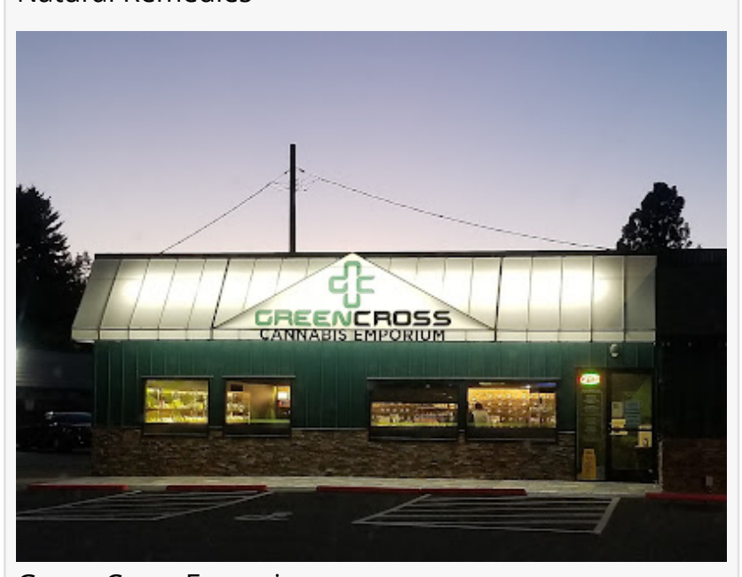
Green Cross Emporium

chains dominate headlines, The Bake Shop, Natural Remedies, and Green Cross Emporium are showing that authenticity, local values, and genuine connection still matter. These three Oregon dispensaries are not only elevating the cannabis experience—they're protecting the soul of the industry.