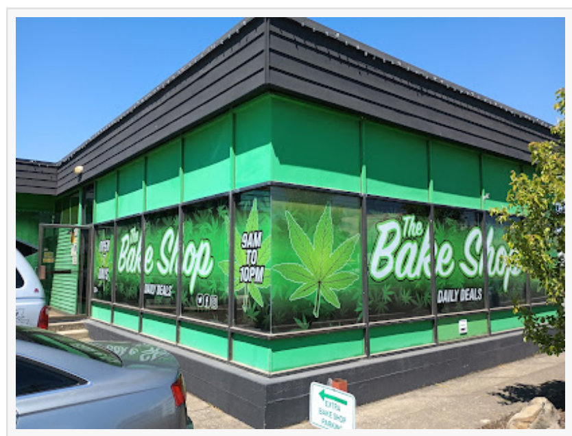
The Bake Shop

SALEM, OR, UNITED STATES, June 25, 2025 /EINPresswire.com/ -- In one of the nation's most competitive and mature cannabis markets, three locally owned Oregon dispensaries are standing out—not through hype, but through heart. The Bake Shop, Natural Remedies, and Green Cross Emporium are proving that the future of cannabis isn't just about THC levels—it's about trust, service, and local culture.