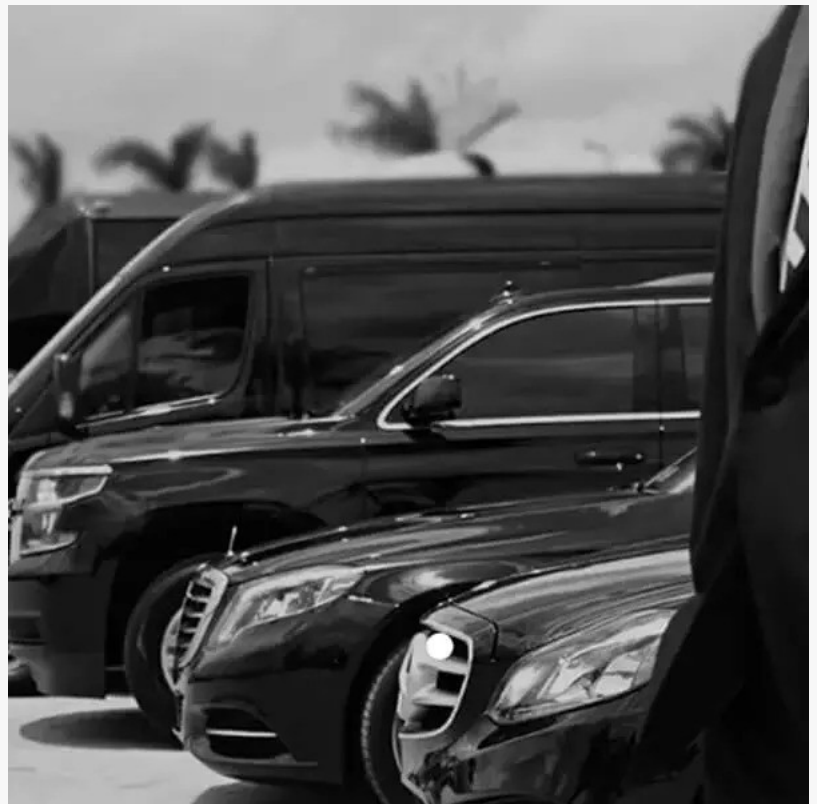
An array of luxury limousines