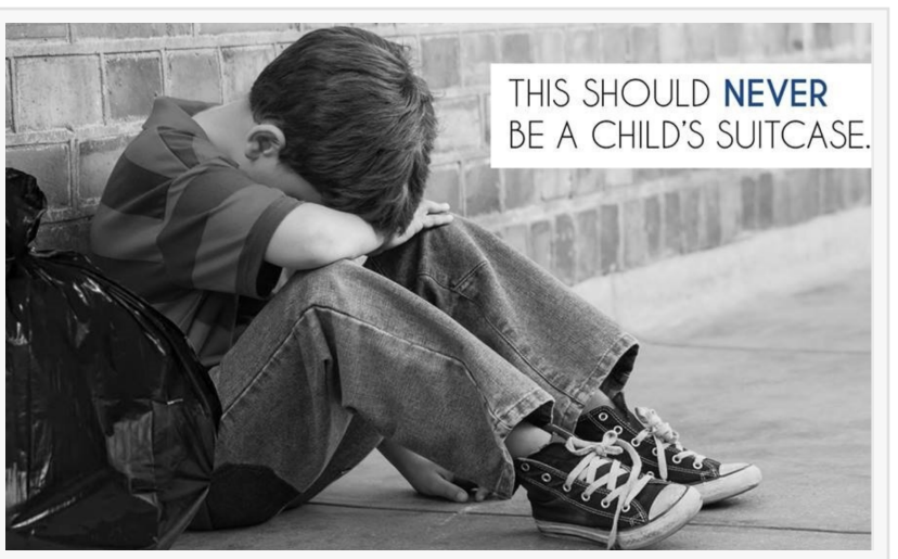
A Child Entering Foster Care Should Never Be Given a Trash Bag. Where is the Dignity?

This partnership reflects YHB's ongoing dedication to service and social responsibility, and builds upon the firm's longstanding tradition of community engagement. Together with Comfort Cases, YHB is making a