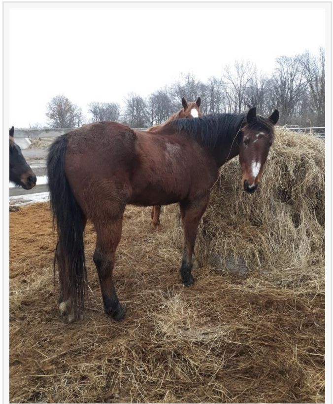
Skip enjoying a quiet moment in the pasture — a calm environment where equine therapy sessions begin.