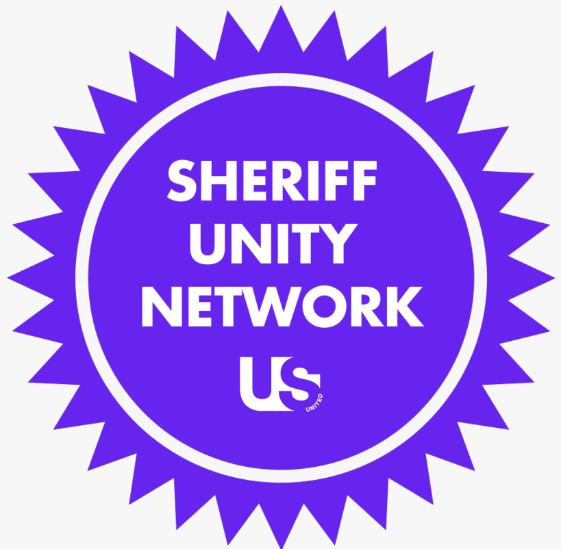
Sheriff Unity Network US United logo

The tour is powered by US United's Sheriff Unity Network (SUN), a first-of-its-kind collaboration comprising over 100 sheriffs nationwide, each committed to supporting their counties through civic engagement and community building. Every tour stop will begin with meetings with local sheriffs and community leaders spearheading unity efforts in their communities, and will follow them in action as we talk with everyday Americans to learn about their hopes, fears, and how they build bridges every day.