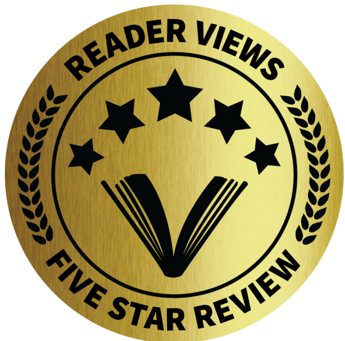
Five Star Accolades