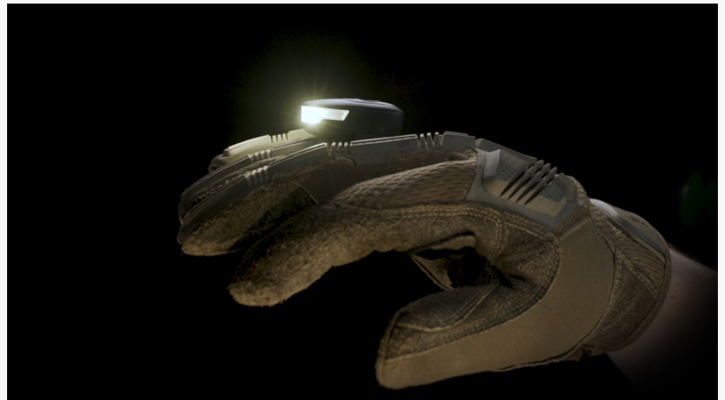
DEX FingerLight Instantly Adjusts to Any Finger Size or Glove