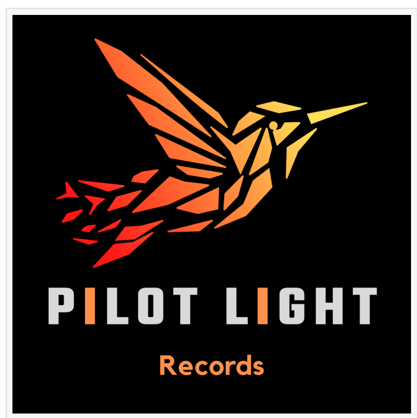
Pilot Light Records of Norwalk, CT

"It's Too Easy" is the first of several singles to be released over the next few months, with the complete album due in early November, 2025. The band