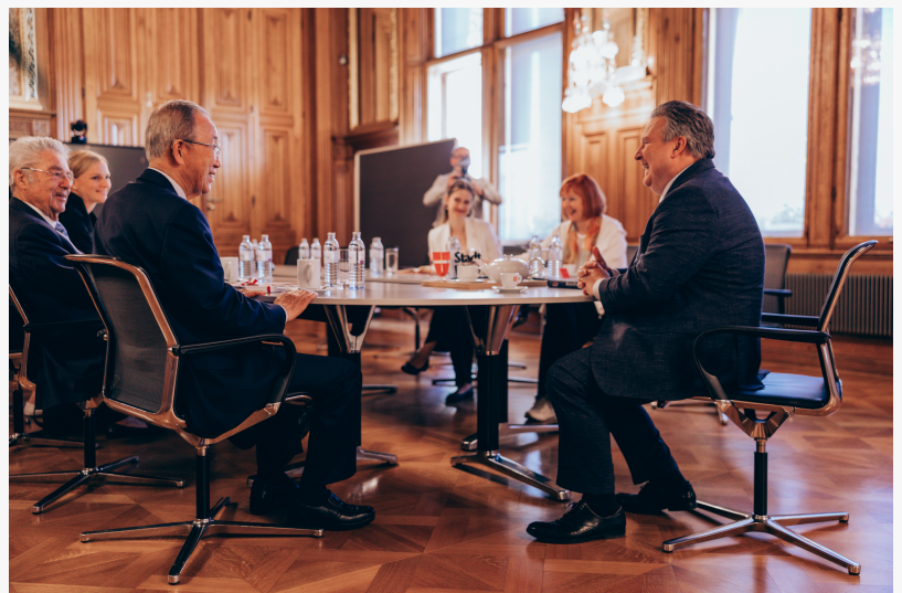
City of Vienna Mayor Dr. Michael Ludwig, BKMC Co-chairs Ban Ki-moon & Dr. Heinz Fischer.