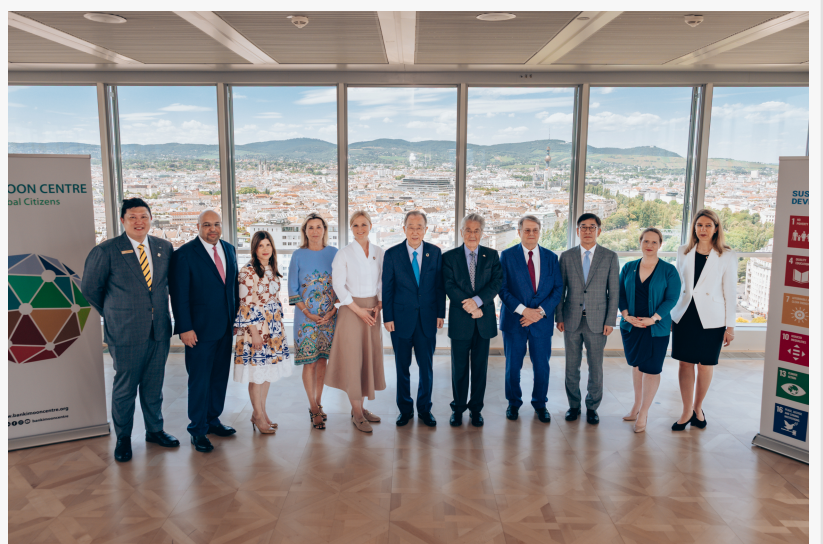
BKMC Board Meeting 2025.

represents. I am pleased to welcome former Secretary-General and long-standing close friend of Vienna, Ban Ki-moon, once again to our city and value the exchange with the Ban Ki-moon Centre as a contribution to the shared goals of sustainable development and global understanding." – Mayor of Vienna, Dr. Michael Ludwig