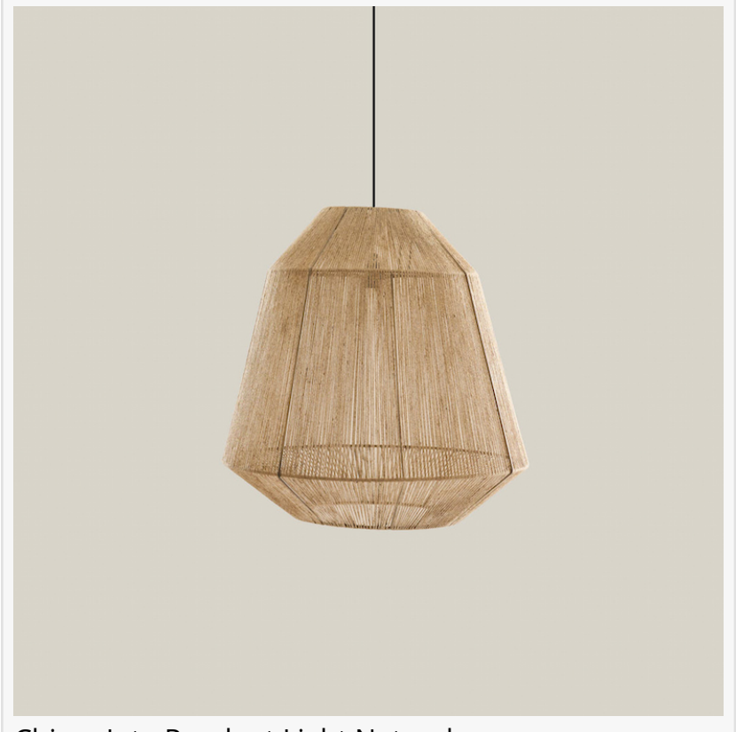
Chiara Jute Pendant Light Natural

offers the perfect lighting solutions for those looking to create a warm, natural atmosphere in their home, bedroom or office. With each light carefully handcrafted from eco-friendly materials,