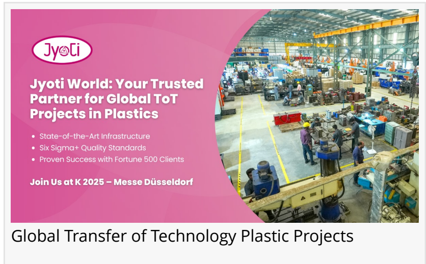
Global Transfer of Technology Plastic Projects

MUMBAI, MAHARASHTRA, INDIA, June 27, 2025 /EINPresswire.com/ -- In response to mounting supply-chain uncertainty, global manufacturers are accelerating plans to diversify production geography. Jyoti World Private Limited reports a significant uptick in Transfer of Technology (ToT) engagements, enabling overseas OEMs to migrate plastics production to India with minimal disruption.