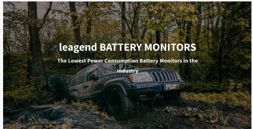
leagend battery monitors

The product range includes the following seven models: