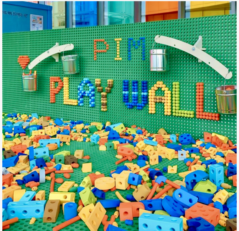
Biggest Builders Space in the World - Seoul, South Korea

LOS ANGELES , CA, UNITED STATES, June 27, 2025 /EINPresswire.com/ -- Bright Day Big Blocks majors in big blocks, big kid-size soft foam building blocks for children that inspire them to create, to express themselves in building anything they can imagine. Youngsters usually build the things they love to think about the most – be it dinosaurs or robots, cityscapes or space stations or medieval castles, vehicles like trains and planes, insects or monsters – anything. The early childhood education community, specifically teachers, have applauded Bright Day over the years for helping them build cognitive skills such as creativity, collaboration, critical thinking, and confidence in their children – as well as physical traits such as strength and stamina, coordination and dexterity, and more.