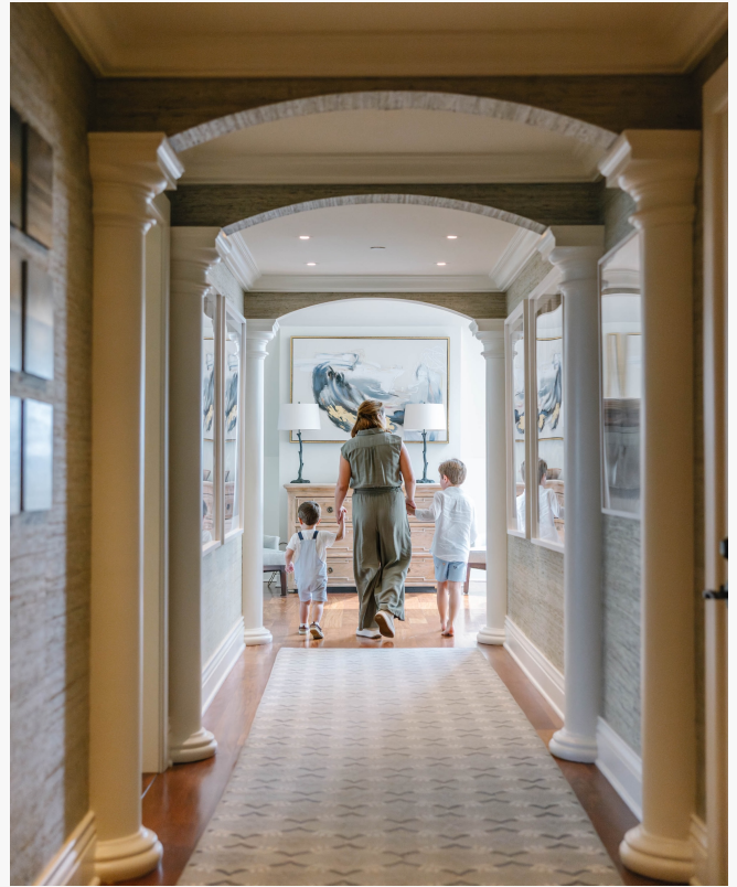
Guests at Ocean House

Ocean House Collection Media Contact The Mayfield Group oceanhouse@mayfieldpr.com