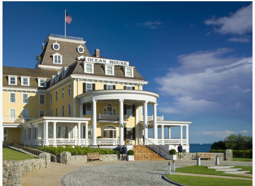
Exterior of Ocean House in Watch Hill, Rhode Island.