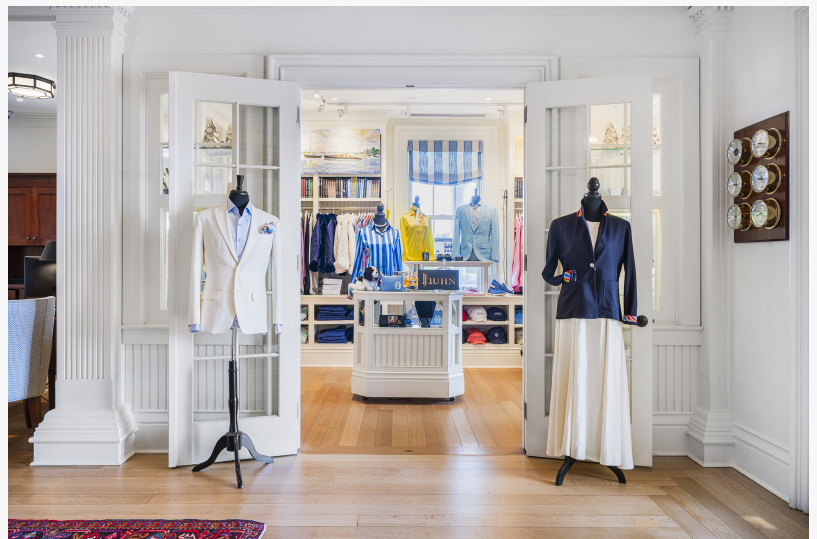
JHuhn Lifestyle Boutique at Ocean House.