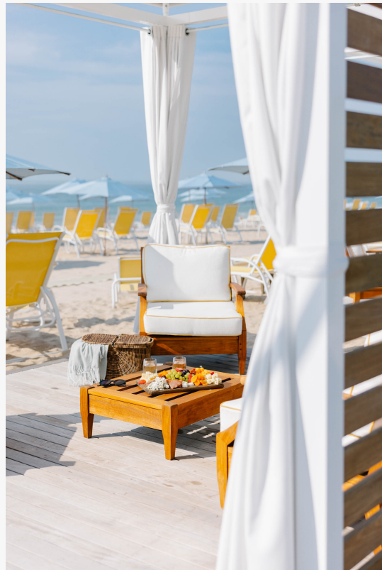
Beach Cabana at Ocean House