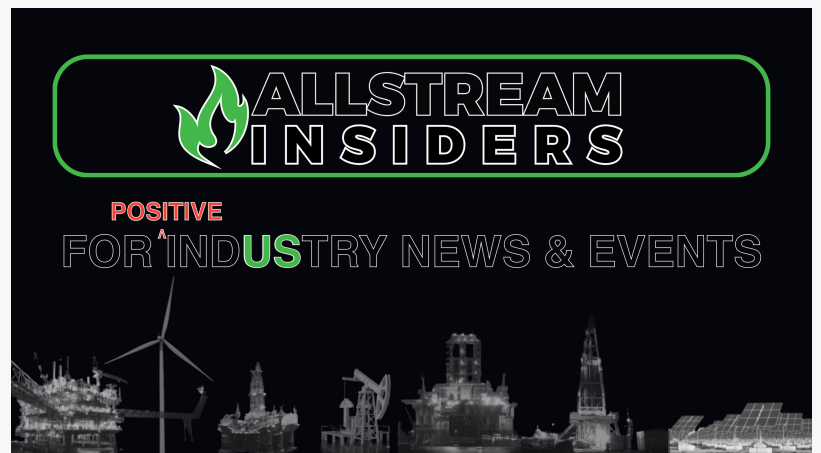
Allstream Insiders "Insider" News and Oil and Gas Events