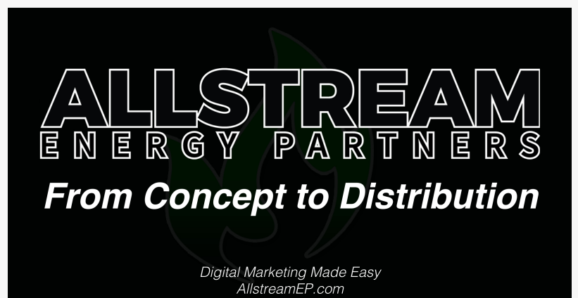
Allstream Energy Partners Houston Digital Marketing Agency